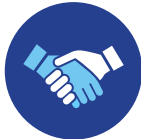
SUPPLY CHAIN DEPARTMENT