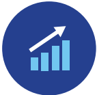
FINANCIAL & ADMINISTRATION DEPARTMENT