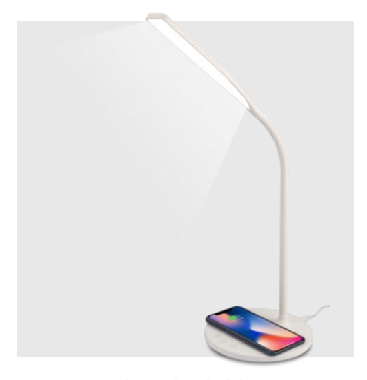
SRP € 59,99