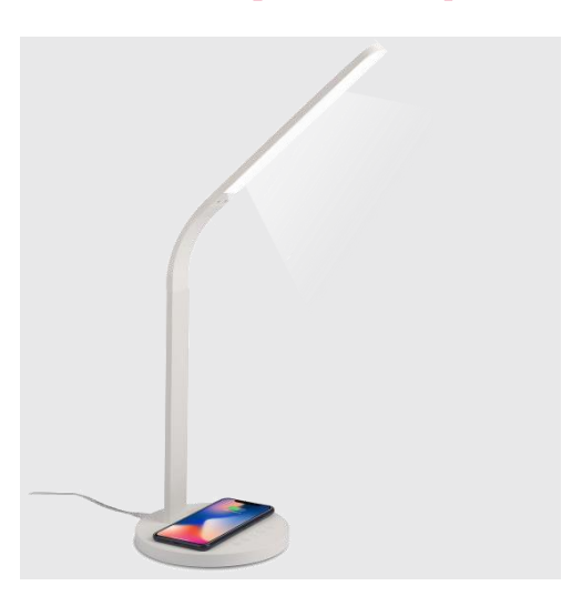
SRP € 79,99