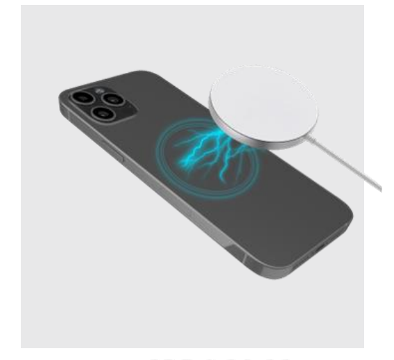
SRP € 29,99