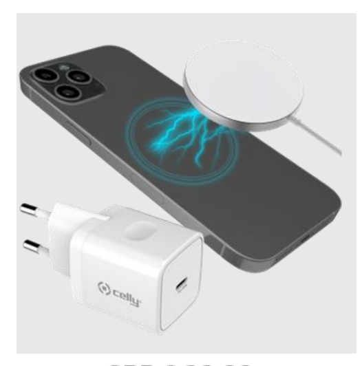
SRP € 39,99