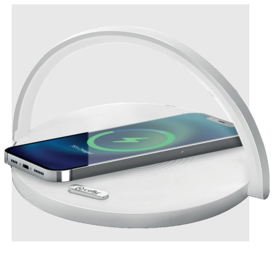
SRP € 49,99