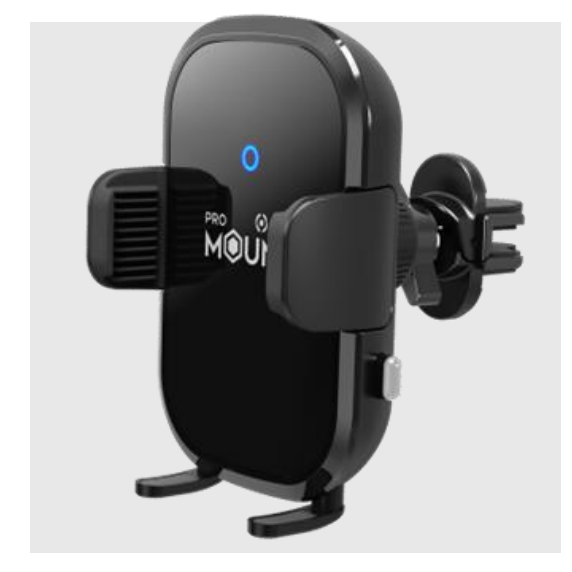
SRP € 59,99