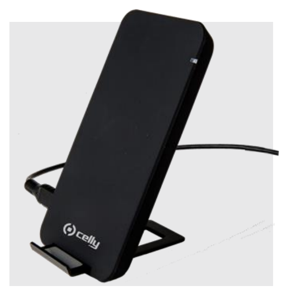
SRP € 39,99