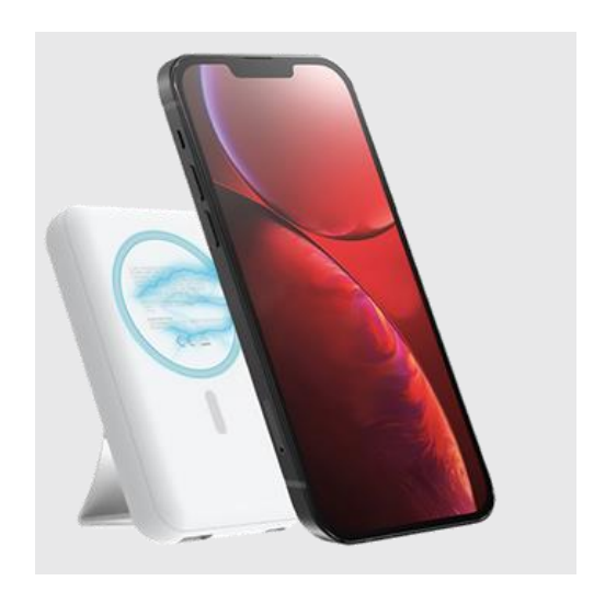
SRP € 59,99