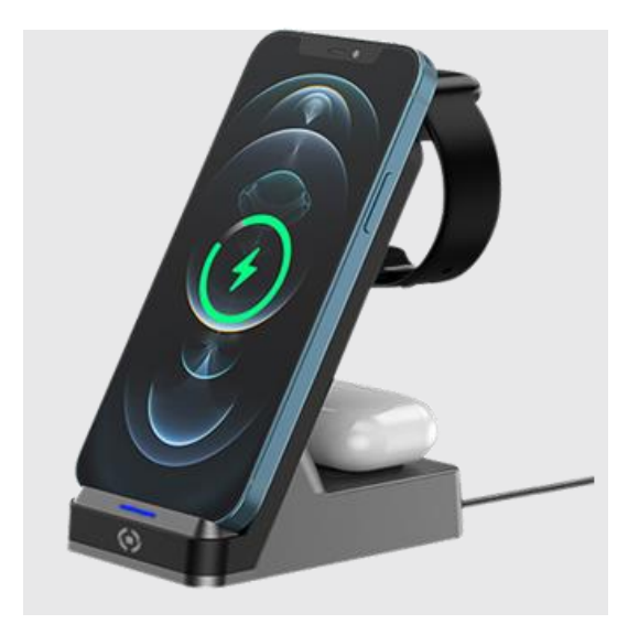
SRP € 59,99